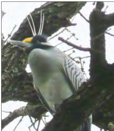
Yellow-crowned Night-Heron spotted by Bill Herod

*includes properties within IHDNA Boundaries only.